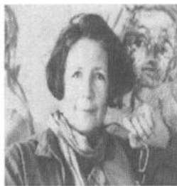
Her theories on children's psychological problems created a sensation.