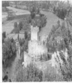
A tour of discovering Normandy.