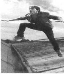
Harry Potter stars add magic to young rich.