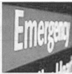
Save Emergency Rooms for emergencies.